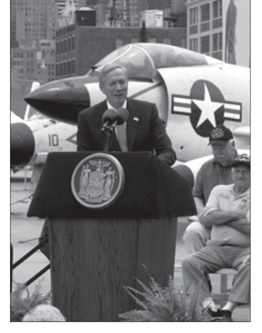
Governor Pataki announces the refit of the Intrepid Sea, Air and Space on the carrier's flight deck July 6.

The Intrepid is scheduled to return to berth the new Pier 86 and reopen to the public in time for Fleet Week 2008.\square